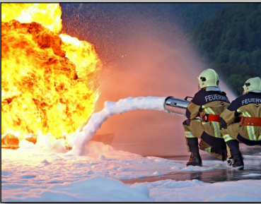
Firefighting Foam Training