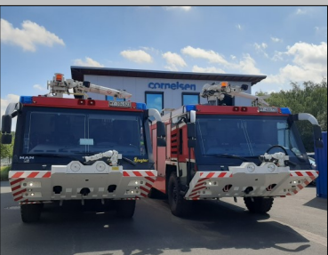
Treated Crash Tenders