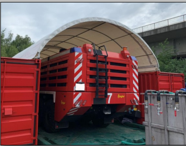
Rinsing & PerfluorAd® Treatment